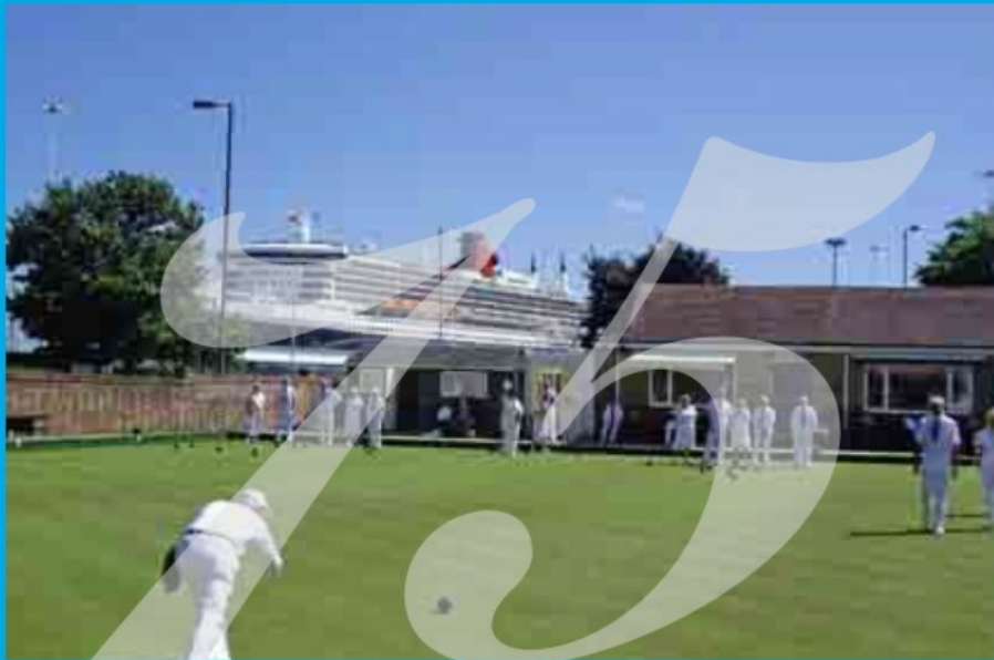
The oldest bowling green in the world, in use since 1299 at Southampton, England

Lawn bowling was a game played by Roman Soldiers, in which stones were tossed towards a target stone with the object of getting as close to the target as possible. Roman legions introduced the game to countries throughout the empire. Over time, the stones were replaced by balls that were usually rolled, rather than thrown. In France, the sport became known as boules , from the Latin word for ball, and the English word bowl came from that French root.